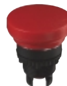
Manual Push Mushroom. Manual Push "In". Spring Return.