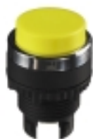
Extended Push Button. Manual Push "In". Spring Return.