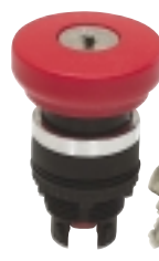
Push Key Mushroom. Manual push "In". Automatic latches "In". Turn key clockwise to release. Spring return. Key withdrawable "Out" position only. Red only.