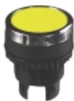
Flush Push Button. Manual Push "In". Spring Return.