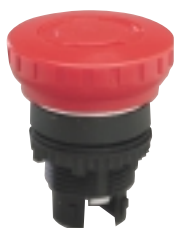
Automatic Push/Turn Mushroom. Manual push "In" Latches "In". Turn clockwise to unlatch. Spring return.