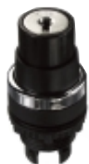
Push Key Push Button. Manual push "In". Spring return. Turn key counter-clockwise to lock "Out"; clockwise to unlock. Key withdrawable locked or unlocked. Black only.